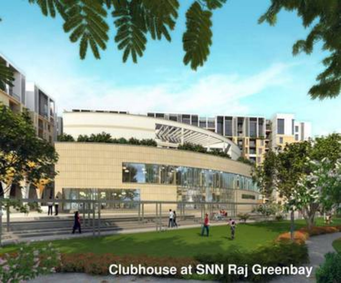
Clubhouse at SNN Raj Greenbay