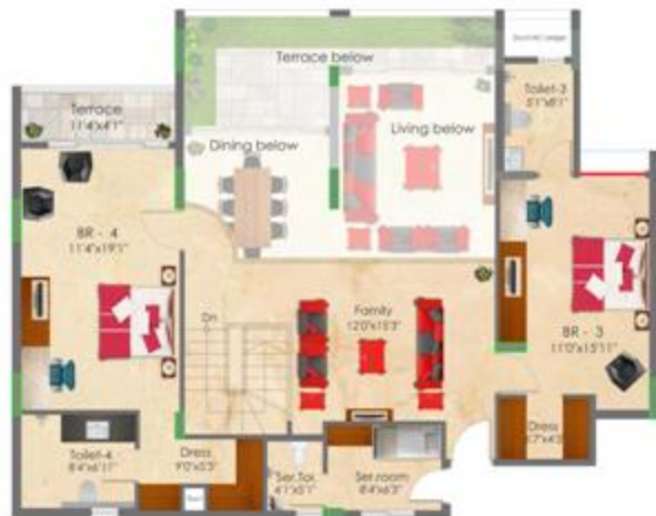
Upper Level 9th Floor