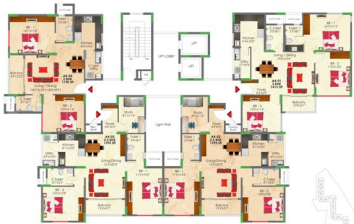
All Block - 1 st to 9 th Floor Plan