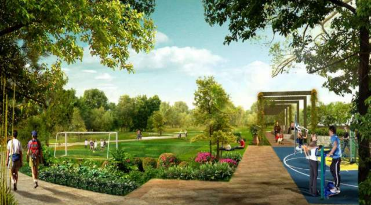
Architects Impression of the walkway and play area at SNN Raj Greenbay