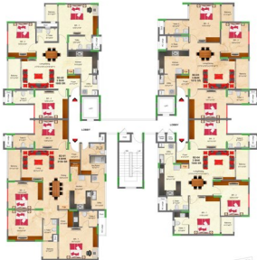
B2 Block - 1 st to 9 th Floor Plan