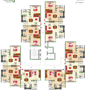
A1 Block Typical Floor Plan