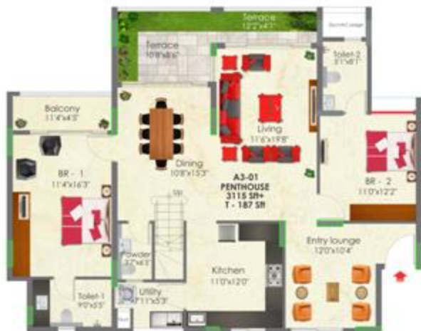
Lower Level 8th Floor