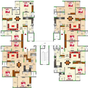
C1 Block - 1 st - 3 rd Floor Plan D1, E1 Blocks - 1 st - 7 th Floor Plan F1 Block - 2 nd to 7 th Floor Plan

■ High-traffic areas ■ Other high-traffic areas